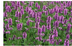
Stachys monieri 'Hummelo

A cousin to the familiar Lamb's-Ears, but not at all similar. This is a clump-forming perennial, forming a low mound of crisp green foliage. In early summer the upright spikes of bright-purple flowers appear, which attract bees to the nectar. Removing faded flowers will encourage more buds to form for weeks on end. An interesting and unusual perennial for near the front of the border, or in containers. Plants may be clipped back hard immediately after blooming, to tidy up the clumps for the rest of the season. Easily divided in early spring. Prefers a sunny location and is hardy to zone 4. The Perennial Plant of the Year is selected by the Perennial Plant Association.